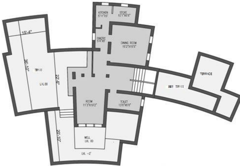
First floor, Principal Bungalow